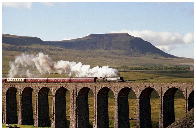
Note irony; Spam can on a Midland Line. Double fault!

Sounds great doesn't it? But it will need to be supported (a) by the strivers who say they want it, (b) by some parents to help with all the child protection stuff and (c) probably some adult volunteers to make up the party (particularly for the NRM because they're not going to get all their signallers out for one and a half boys and a dog). SO, it's up to you to prioritise Striver Travel in your diaries as dates have to be dependent on what the venue is prepared to offer. To test the water, I'm minded to try a trial trip to Settle Signal Box via the Settle & Carlisle. It's rumoured that there are some Strivers who haven't travelled over the S&C. Outrageous! Not even the fact it's a Midland line is an excuse . . .